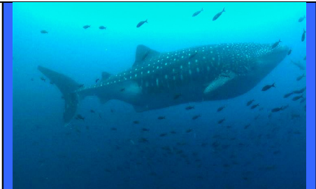
'Shirley' our Whale Shark