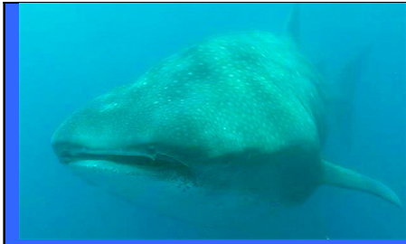
'Shirley' our Whale Shark